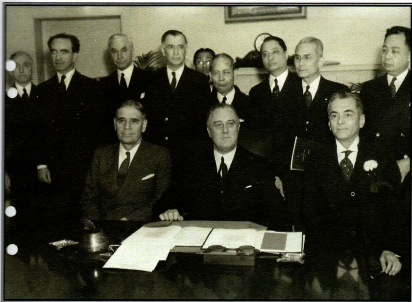
S.C. 4x5 negative 101814.

The President of the United States, Members of the Philippine Mission, presenting the Constitution of the Philippine Commonwealth, et al, at the White House, Washington, D.C., March 23, 1935.