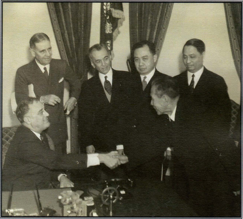
No. 10118094x5 Neg.

Committee on Constitutional Convention of the Philippine Islands which brought the original draft of the Constitution to Washington, D.C. for the approval of President FDR. March 18, 1935.